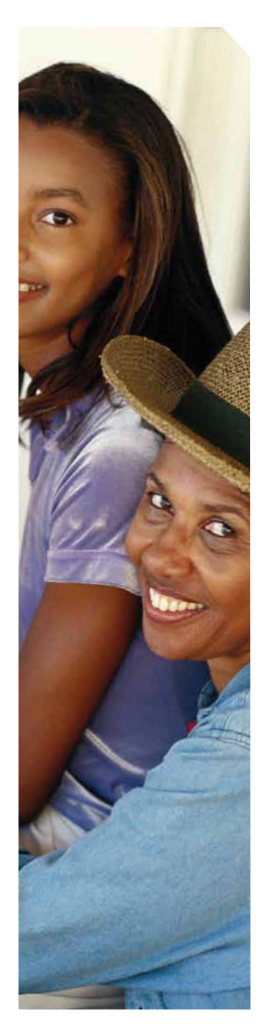
Chapter 1 What is Kinship Care?