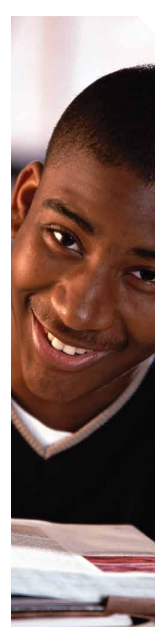
Chapter 5 Finding Help with Educational Services