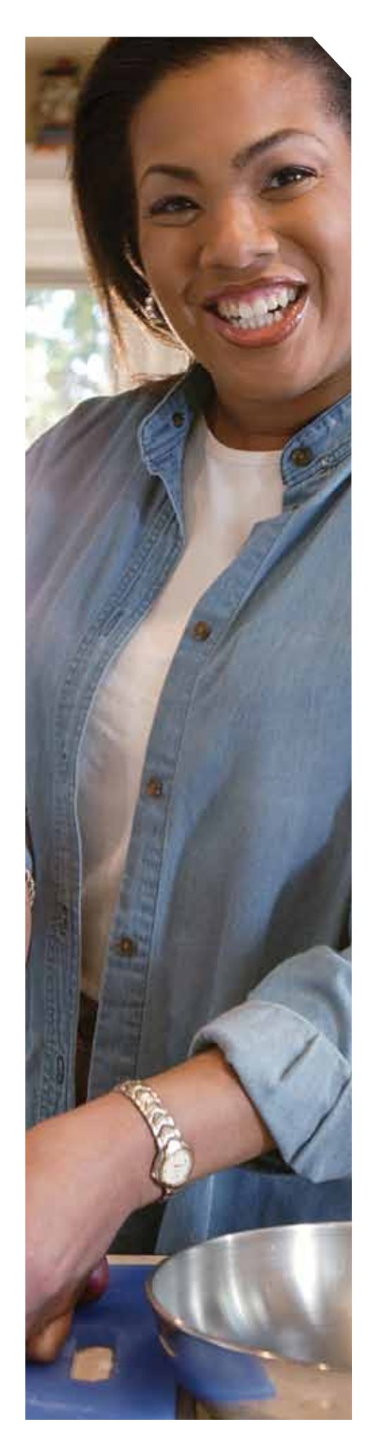
Chapter 3 Finding Help with Expenses